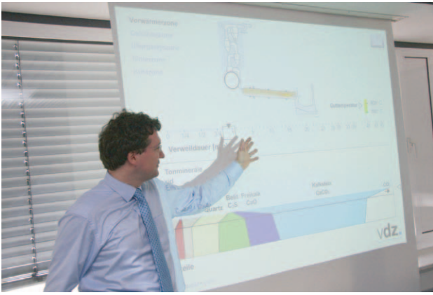
Figure 1. Classroom training as part of blended learning activities.